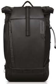
Lenovo 15.6" Commuter Backpack