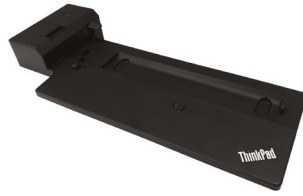
ThinkPad Pro Docking Station