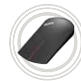
ThinkPad® X1 Wireless Touch Mouse