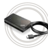
ThinkPad® OneLink+ Dock