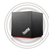
ThinkPad® WiGig Dock