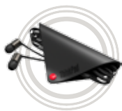
ThinkPad® X1 In-Ear Headphones