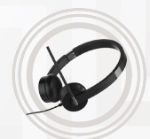
Lenovo Stereo Headset