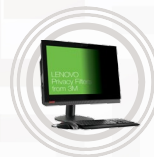
Lenovo Privacy Filter for ThinkCentre AIO from 3M