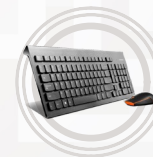
Lenovo Professional Wireless Combo